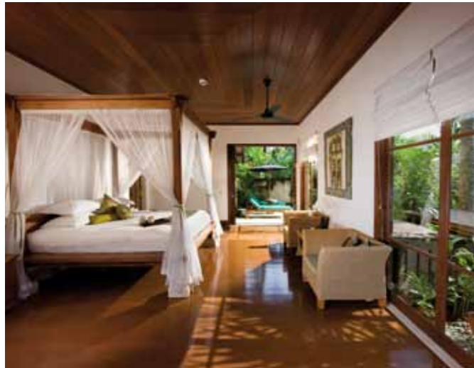
One of the seven bedrooms throughout the property