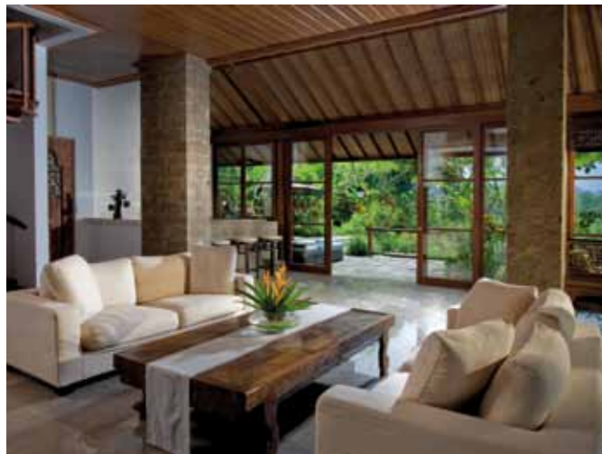
A place to chill out